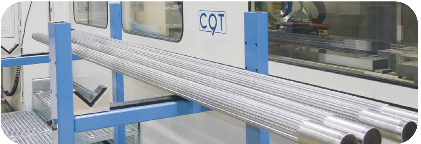
Splined shafts for twin-screw extruders